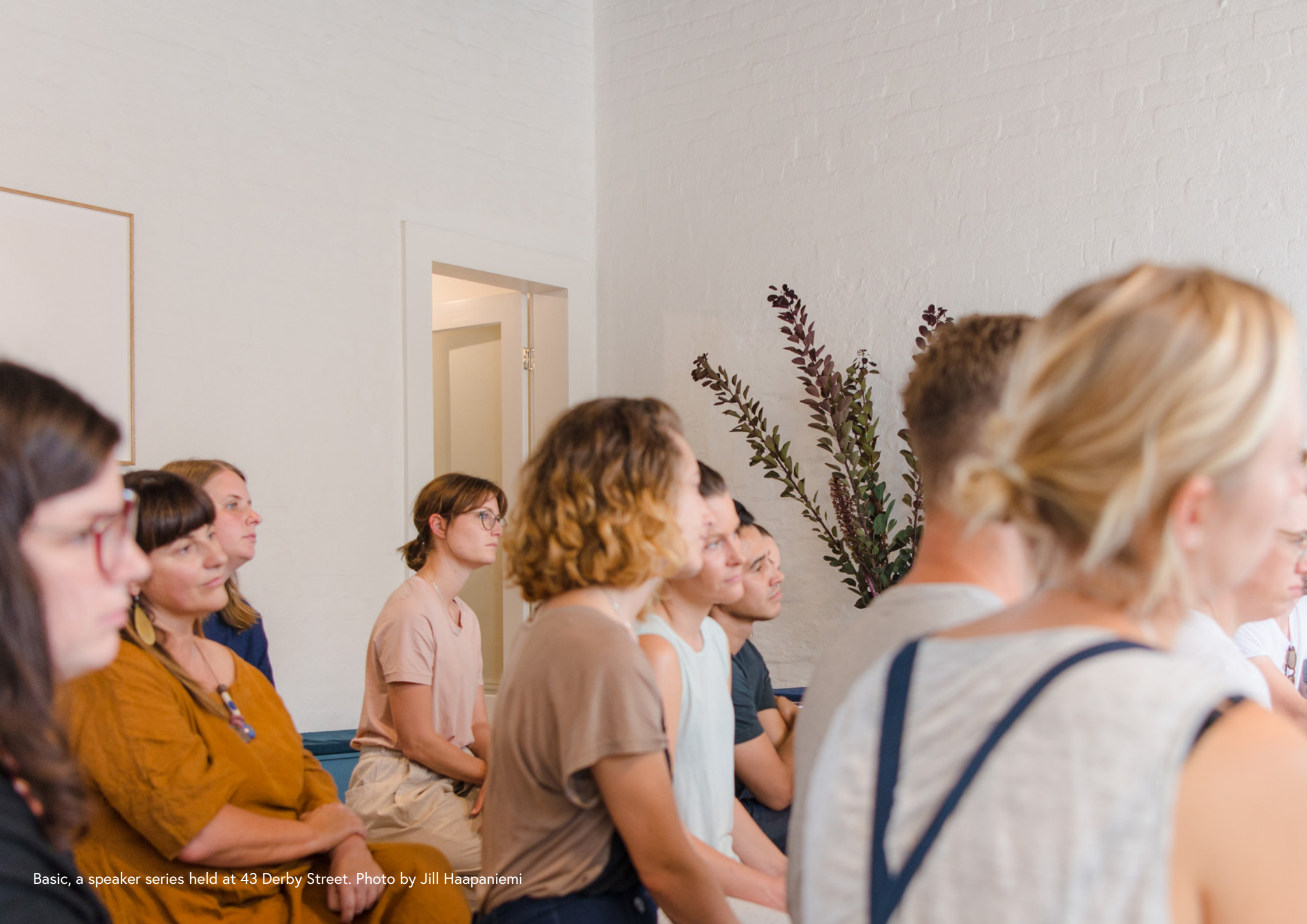
Basic, a speaker series held at 43 Derby Street.